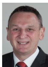
Chair, Economy & Culture Scrutiny Committee February 2020